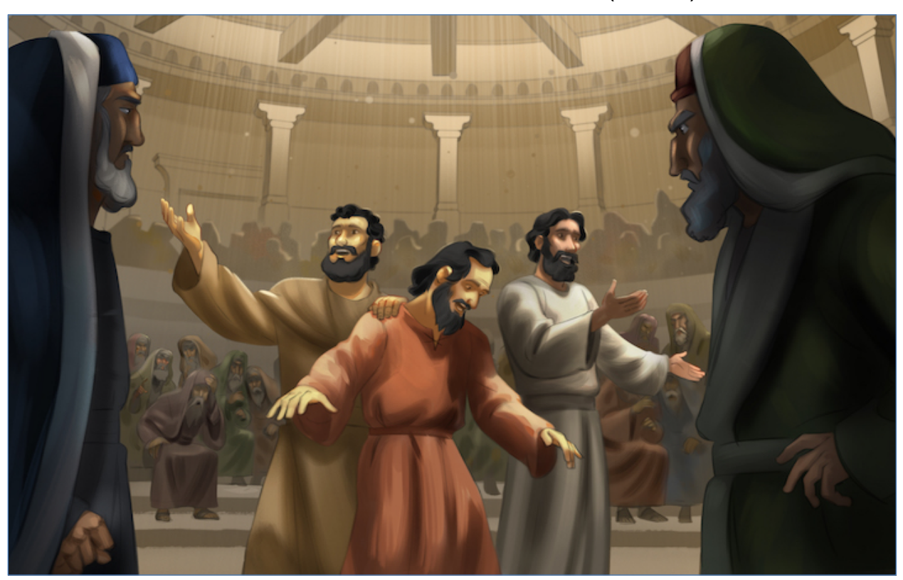
Unit 30, Session 3 Peter Continued to Preach (Acts 3)